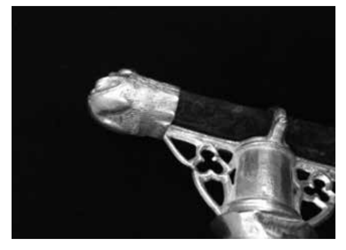
Provenance: Santa Clara-a-Nova Coimbra Monastery (CRSI 32). September 16th, 2016