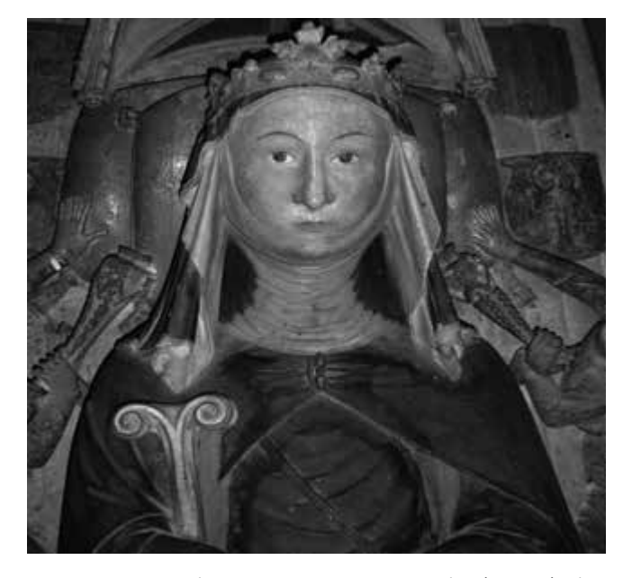
Provenance: Santa Clara-a-Nova Monastery - Coimbra (CRSI 32).