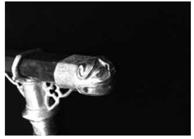
Provenance: Santa Clara-a-Nova Coimbra Monastery (CRSI 32). September 16th, 2016

red is considered to be the color of the Holy Apostle James (Faci Ballabriga 1999, II: 33), identified as "sardinus" in the Comentarios of Beatus of Liébana (Moralejo and Real 1999; Macedo 2004, 24-25)—, the same stone material used in the conception of the processional cross belonging to the personal items of D. Isabel. Polished and carved on eight facets, the jasper stone was fixed in the center by a small silver rim attached to the central stem, endowed with a sharp edged knot, and reinforced at the poles by two stylized and chiseled figures forming diametrically opposed lion heads, also made out of silver (Figs. 16-17).