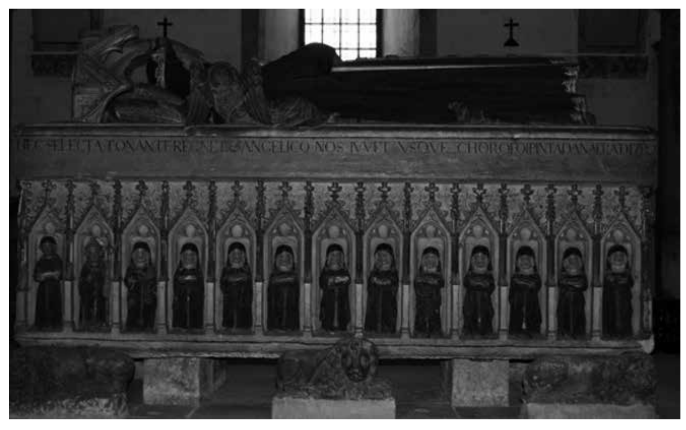
Santa Clara-a-Nova Monastery, Coimbra (CRSI 32).