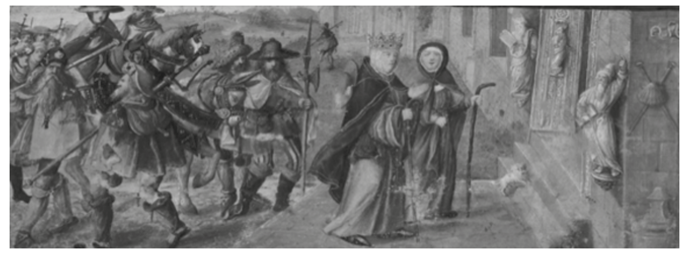
Genealogia da Casa Real de Portugal. (Add MS 12531, folio 9r).

Arrival of D. Isabel of Aragon and her entourage to the Cathedral of Santiago de Compostela through the south portico on the silver facade (detail of the illuminated manuscript frame - left section). António de Holanda and Simão Bening. Illuminated manuscript 1530-1534