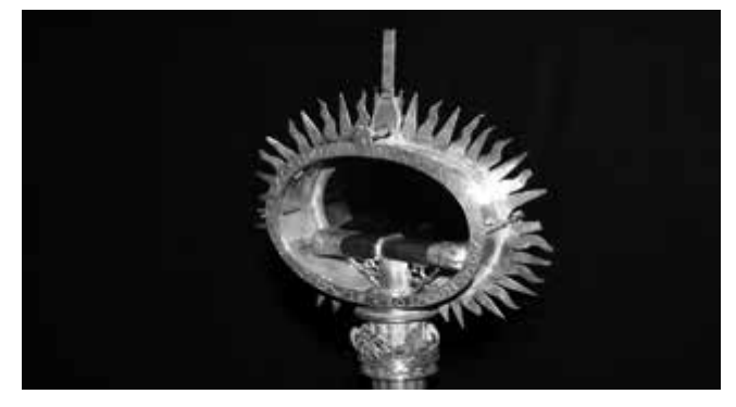
Provenance: Santa Clara-a-Nova Monastery - Coimbra (CRSI 397). Photographic Record: Milton Pacheco, June 7th, 2008.

With the execution of this "silver bearer", as the Franciscan Friar Manoel da Esperança [1586-1670] called it in 1666 (Esperança 1666, II: 306), the staff, a relic of second-class according to the Church, was properly secured and more easily protected from possible attempts of obtaining some spiritual graces after direct contact performed by the believers. For that same reason, the reliquary should be kept in the high choir of the old monastic church, nearby of the Queen's tomb chapel and the altar dedicated to her (Esperança 1666, II: 35).