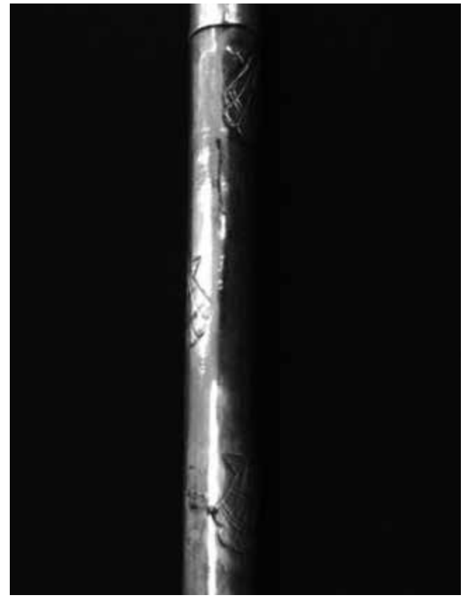
Provenance: Santa Clara-a-Nova Coimbra Monastery (CRSI 32). Photographic Record: Milton Pacheco September 16th, 2016.

for the relic's accommodation -a container made of silver and crystal with 147 cm high, 29.8 cm wide and 19 cm deep (Fig. 10)— the staff was integrated with the amputated lower section. Although its physical composition is unknown, it is to be assumed that the sent fragment of the staff was finished with a spike foot, encased in a single (and solid?) piece of silver, or of another metal, but equally coated in silver. The presence of this spike feet finishing the lower section of the staff would give it a greater resistance to the impacts caused by constant movements, as we know from similar pieces still used today, such as the episcopal staff or even the silver staffs steered by the board members of the Holy Queen Isabel Brotherhood during the festivities of our patron saint. Moreover, a close examination of the oldest representations of the staff, present in the stony image of Saint James in the Glory Portico and in the twelfth century sculpture of the same saint, placed in the Museum of the Cathedral of Santiago de Compostela, attest to the existence of a spike a trimming the lower section of the dowel.<sup>21</sup>