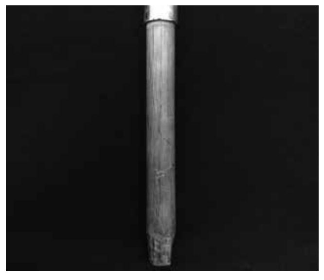
Photographic register: Milton Pacheco. September 16th, 2016.

According to the chief surgeon's report, tied to the staff were "a square bag which the outside cover looked like silk and its inside leather with some tattered parts, and inside it was no other thing more than a devotional scapular as wide as a hand with a square plate bore with a cross of gold thread" (Vasconcelos 1993, II: 115-116, 122). On one side of the escarcela it was embroidered "the figure of the same Apostle, and on the other [side] the shell of his insignia" (Escobar 1680, 223), the most characteristic Jacobean symbol representation, it is uncertain if it was made of lead or tin like those that were acquired by the pilgrims in Compostela (Sebastian 1994, 302).