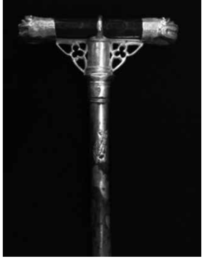
Provenance: Santa Clara-a-Nova Monastery - Coimbra (CRSI 396). September 16th, 2016