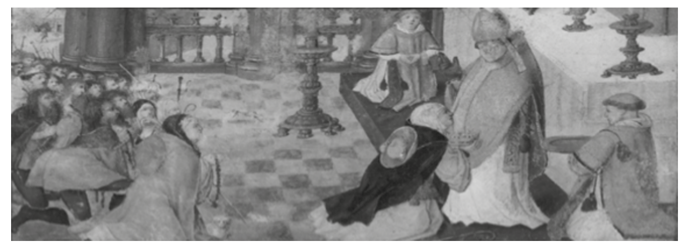
Provenance: © The British Library Board, Genealogia da Casa Real de Portugal. (Add MS 12531, folio 9r).

D. Isabel of Aragon at the time of the offering to Archbishop D. Berenguel de Landoira (detail of the illuminated manuscript frame - right section). António de Holanda and Simão Bening. Illuminated manuscript 1530-1534