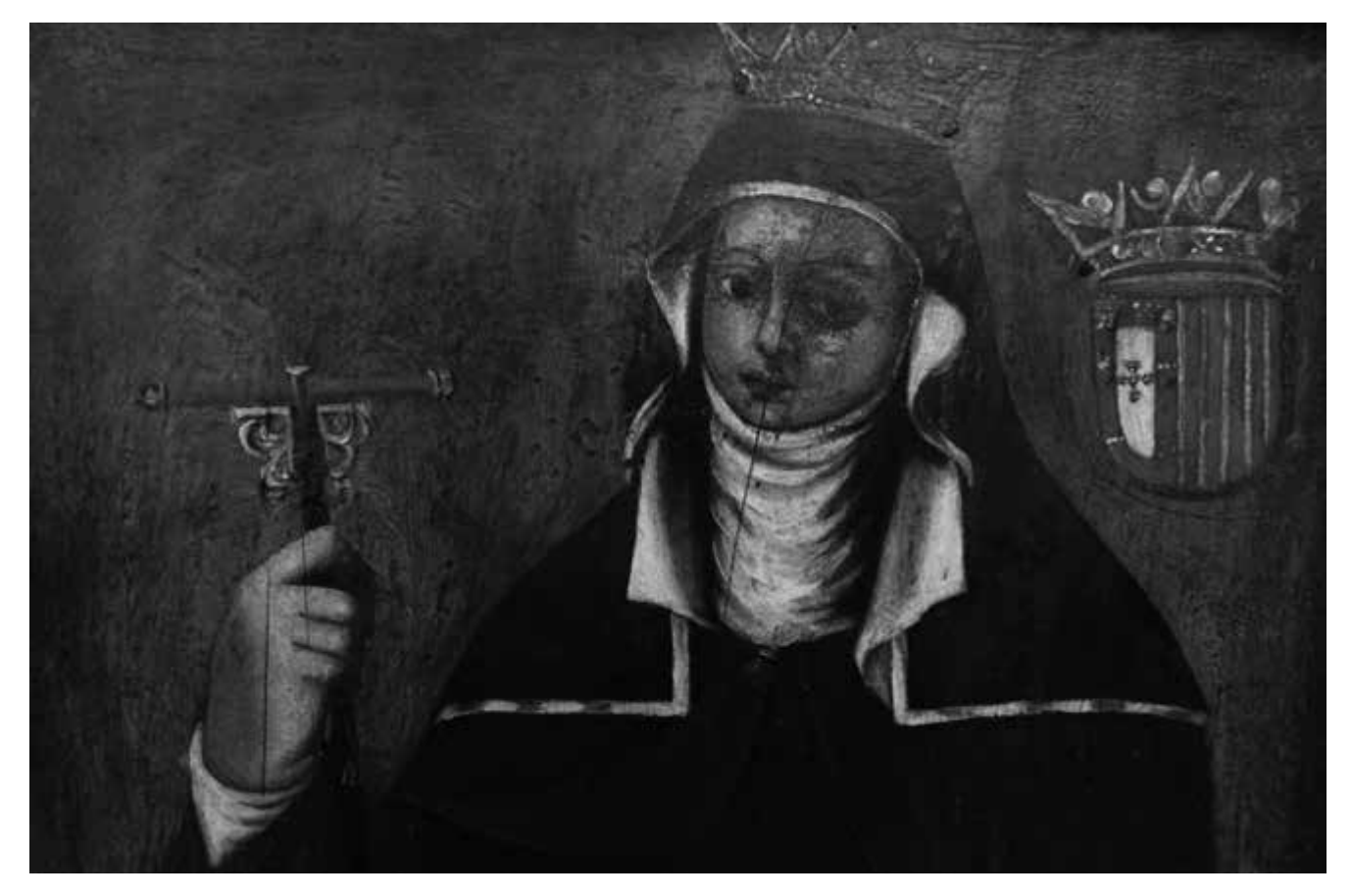
Provenance: Santa Clara-a-Nova Monastery - Coimbra (CRSI 734).

Since then, the relic staff has been the target of continuous devotional manifestations by devotees of the Holy Queen and more recently, in the late twentieth century, required for religious art exhibitions to satisfy the curiosity of visitors. But it is at the Church of Santa Isabel of Portugal, of the Monastery of Saint Clare in Coimbra, that the relic staff can be worshiped by the believers and admired by the visitors all year long.