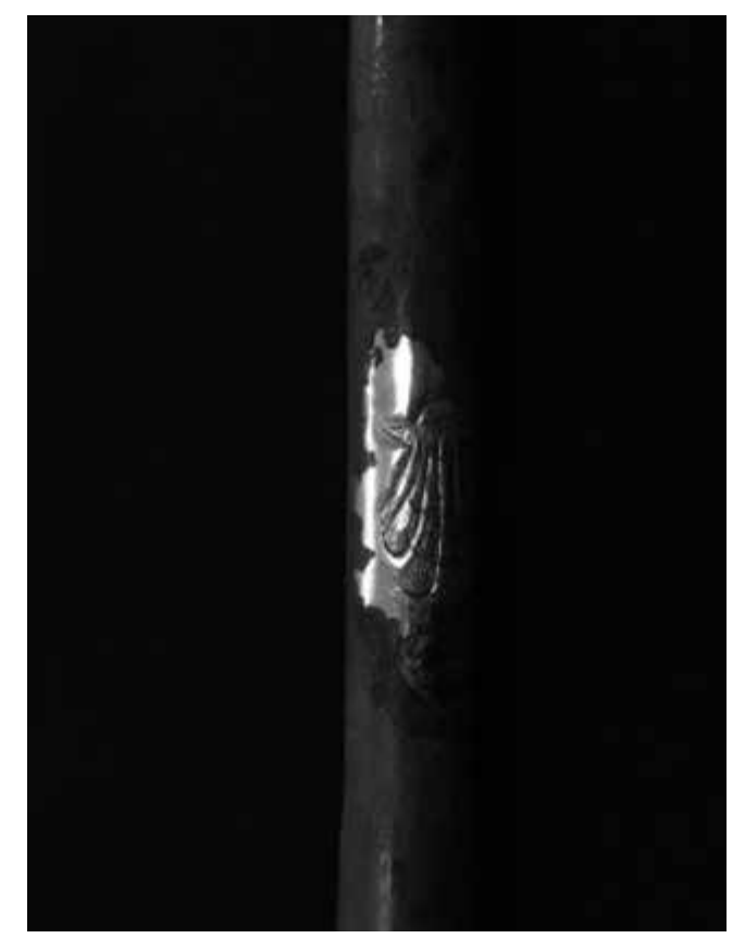
Provenance: Santa Clara-a-Nova Coimbra Monastery (CRSI 32). September 16th, 2016.

en internal structure, only four can be found, which were adorned with the supreme Jacobean symbols: the scallop shells —a total of fourteen—, scored in a stylized manner along the surface of the dowel and coated with a goldenglimmering silvery matter (Figs. 14-15).