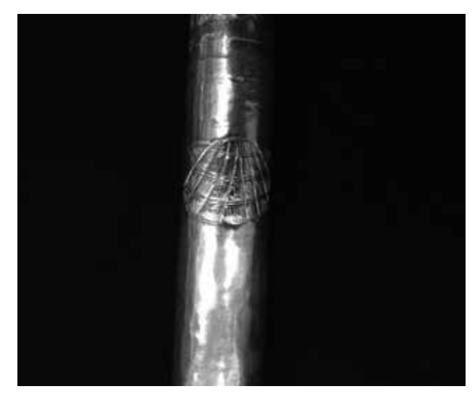
September 16th, 2016.