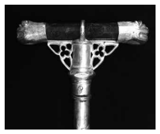
Photographic register: Milton Pacheco, September 16th, 2016.