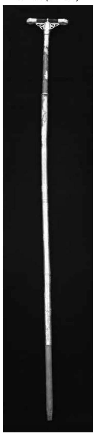
September 16th, 2016.

FIGURE 6 Pilgrim's Staff of D. Isabel of Aragon, the Holy Queen. Compostelan Workshop, Goldsmithery, | c.1325 (?) Provenance: Santa Clara-a-Nova Monastery -Coimbra (CRSI 396)